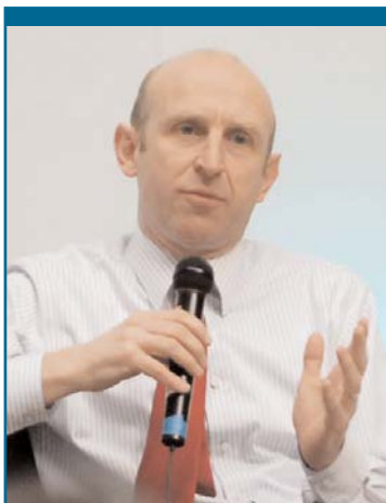
Minister John Healey

'I talk about the Tees Valley a lot in other areas of the country...the foundations which you have laid in your Multi Area Agreement, the strengths of working relationships and strengths of your shared goals.'